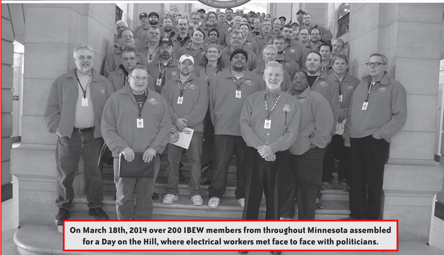
On March 18th, 2014 over 200 IBEW members from throughout Minnesota assembled for a Day on the Hill, where electrical workers met face to face with politicians.