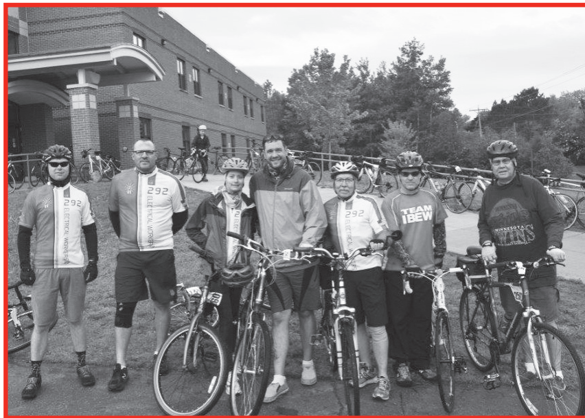
IBEW MS 150 Team

If you have any questions or concerns, please feel free to contact the Limited Energy JATC at 763-571-5922.