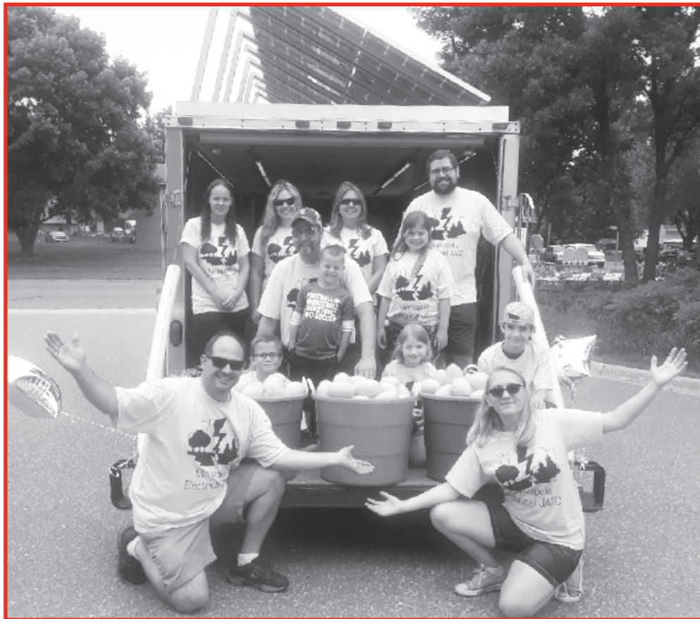
The PowerPartner Solar Powered Trailer for the Grande Day Parade with JATC staff and family.

For the first time, the JATC participated in the Albertville Friendly City Days Grande Day Parade. Community outreach and letting the community know who we are is important for the promotion of our union image and what apprenticeship is all about.