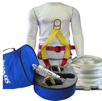
ED System with HW-Escape