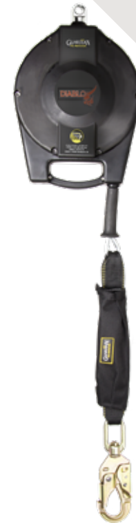
Diablo Big Block SRL