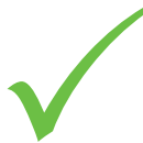
Fig. C - Back label will be marked with a green checkmark - OK for use.